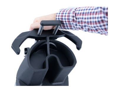
Fig. 22: ...from the center