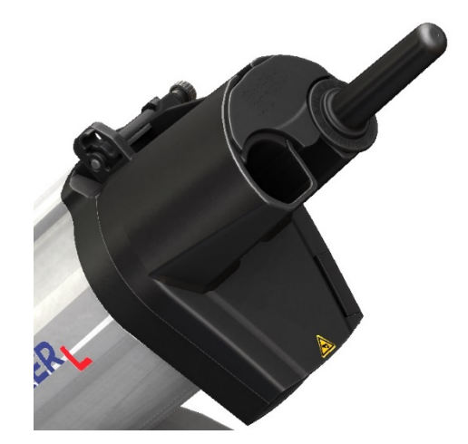
Fig. 27: Plunger inserted