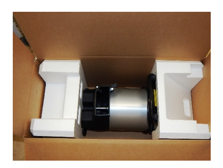
Fig. 13: Packed in styrofoam elements

The ANLIKER L vegetable cutter was cleaned at the manufacturer before dispatch. We recommend, however, to clean the device prior to its first use with a food grade cleaning product.