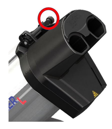
Fig. 26: Device locked

Start the machine with the locking lever and feed in the vegetables. Use the plunger to push down the vegetables (Fig. 27). Open the locking lever to stop the machine.