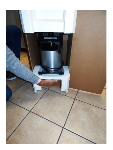
Fig. 14: Taking the device out of the cardboard box

Prior to any utilization or transport of the vegetable cutter, remove the protective styrofoam and other pluggable elements (e.g. cable clips) used for transport. Best place the cardboard box in vertical position and pull out the device (see Fig. 14).