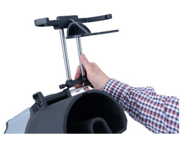
Fig. 28: Removing the plunger

Hold the top so it cannot move (Fig. 24), fold back the plunger and push out of the opening (Fig. 23). The top can now be removed (Fig. 25).