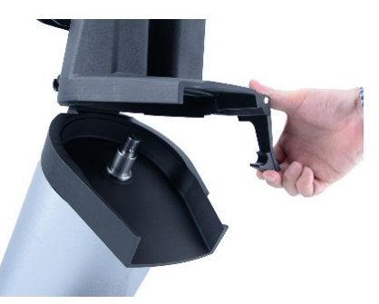
Fig. 16: Open the top

First open the locking lever and swing up the top.