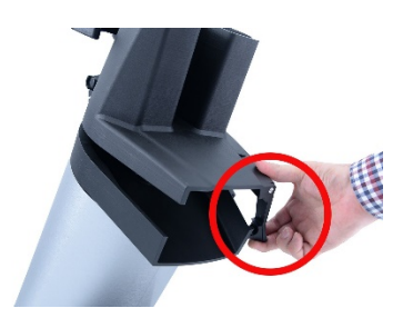
Fig. 11: Locking lever