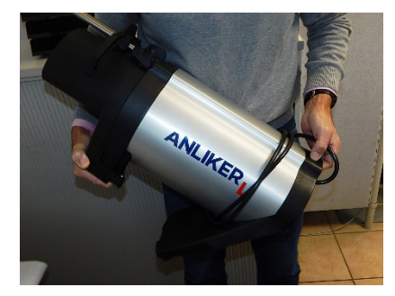
Fig. 15: How to carry the device

Or carry the device as illustrated in figure 15.