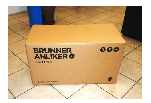
Fig. 12: Cardboard box

The device is consigned packed in a cardboard box and protected by styrofoam elements (see Fig. 12 and 13).