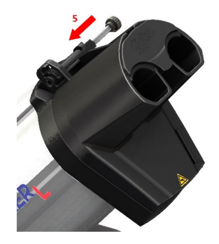
Fig. 25: Lock the device