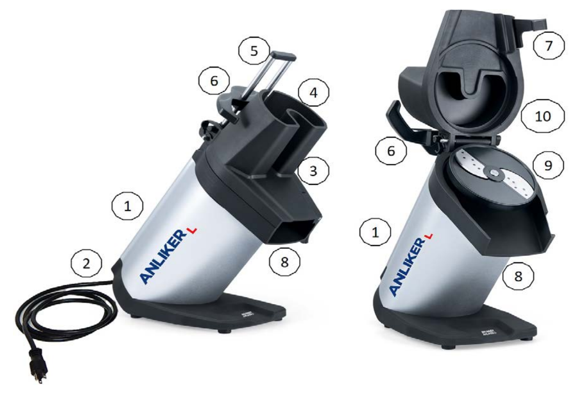
Fig. 2: System components - part 1

Figures 1 and 2 show the vegetable cutter and its single system components. The pictures serve as examples. For dimensional details, please refer to the dimensional drawing (Fig. 30).