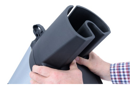
Fig. 31: Place the top

Ensure that the tappets snap into the opening (do not exert pressure).