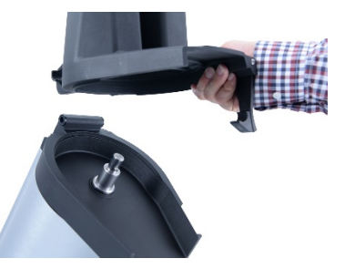
Fig. 30: Remove the top